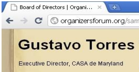
Organizer’s Forum Board of Directors Page