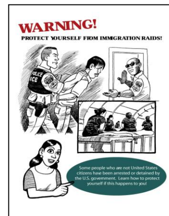
Raid brochure produced by NLG CASA de Maryland

“Some people who are not United States citizens have been arrested or detained by the U.S. government. Learn how to protect yourself if this happens to you.”